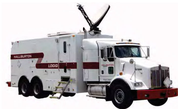
LOGIQ™ Logging Truck